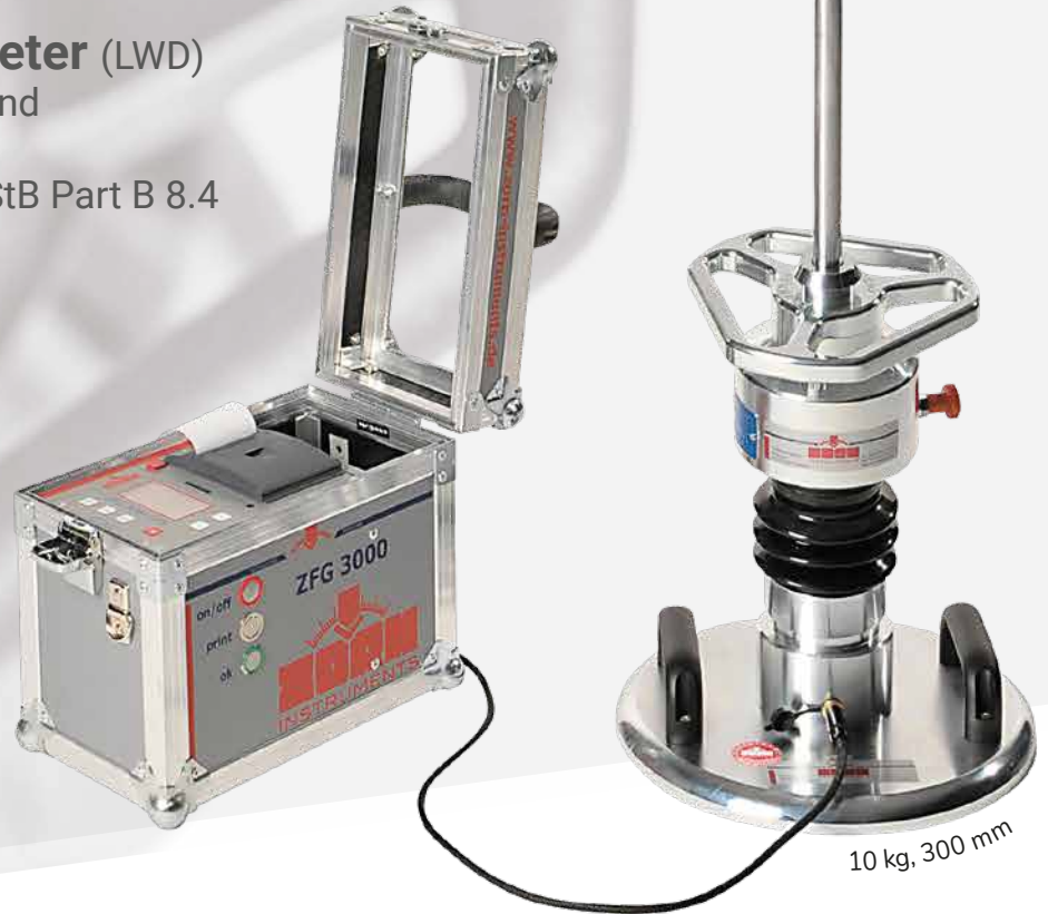
10 kg, 300 mm